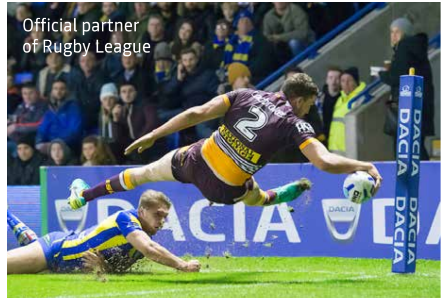
Official partner of Rugby League

For us, putting in the extra mile doesn't stop at making great value cars. We take great pride in playing an active part in the community and giving back to communities throughout the UK. We support the life-saving work of the Nationwide Association of Blood Bikes . We get stuck in as the official partner of Rugby League . We also run an annual Dacia Day , full of fun and games for our amazing Dacia drivers – maybe we'll see you there next year? In the meantime, keep up with us on our Facebook page or Youtube Channel.