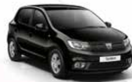
Pearl Black (676)