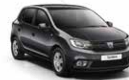
Slate Grey (KNA)