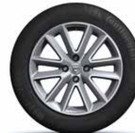
16" Taiga alloy wheels