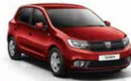
Cinder Red (B76)