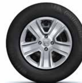
15" Lassen steel wheels