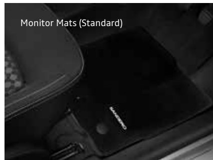
Monitor Mats (Standard)