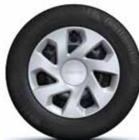
15" Tarkine steel wheels