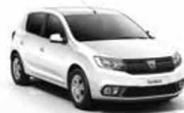
Glacier White (369)