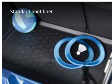
Standard boot liner