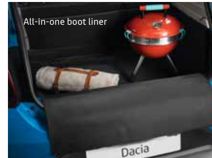
All-in-one boot liner