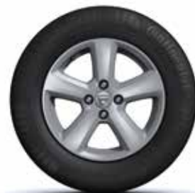
15" Sagano alloy wheels