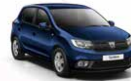
Cosmos Blue (RPR)